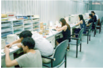
New Product Development