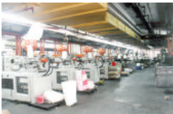
Injection Moulding Machines