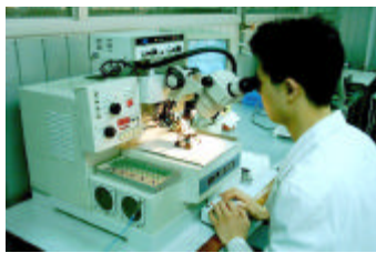
Fully Automatic Machine Vision Chip-on-Board Wire Bonder