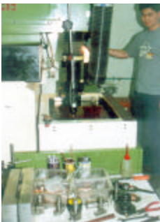
In-house EDM Tooling for Mould Making

Very high quality reputation, skilled and stable workforce of over 350 in our 300,000 SF factory in Macau.