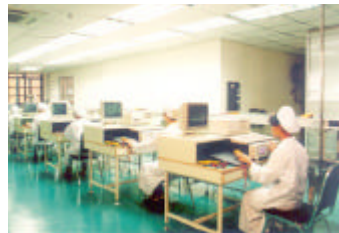
Electronic Product Assembly Line