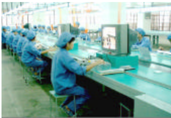
Electronic Product Assembly Line