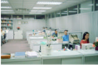
New Product Engineering & Development