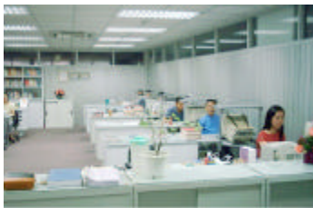
New Product Engineering & Development