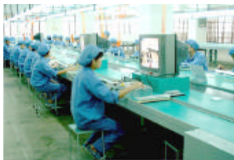
Electronic Product Assembly Line