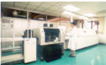
Fully Automatic SMT Line - Screening, Placement & Soldering

Very high quality reputation, skilled and stable workforce of over 350 in our 300,000 SF factory in Macau.